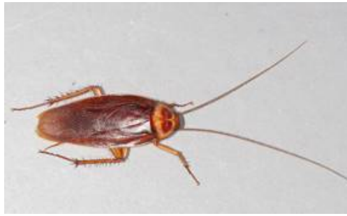
The American Cockroach.