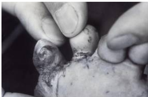
Cutaneous larva migrans (CLM) occurs as red, inflamed lesions in the skin where the larvae of canine hookworms burrow under the skin.

Contaminated soil is an important hookworm source when it comes to a human disease called cutaneous larva migrans. Running barefoot through the park or beach may seem pleasant but if the soil has been contaminated with canine fecal matter, the eager infective larvae may be waiting to penetrate your skin.