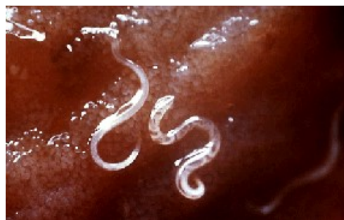
Hookworms are attached to the intestinal lining.

The adult hookworm lives in the small intestine of its host where it hangs on to the intestinal wall using its 6 sharp teeth. This means that, like other parasitic worms, they are bathed in intestinal contents but while other worms share the host's food by absorbing it directly through their skin, hookworms feed by drinking their host's blood. The adult worm lives and mates within the host's intestine and ultimately, the female worm produces eggs. Hookworm eggs are released into the intestinal contents and passed into the world mixed in with the host's stool.